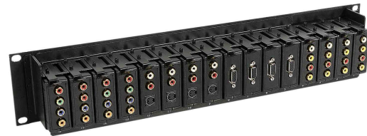
Fully loaded - rear view