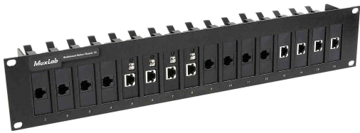
Fully loaded - front view