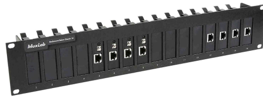
Blank Filler Modules (500901) in eight (8) slots